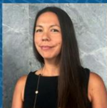
Amity Boye White & Case LLP