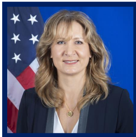
Beth Van Schaack U.S. Ambassador-at-Large for Global Criminal Justice