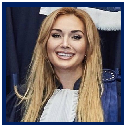
Ganna Yudkivska Judge, European Court of Human Rights (2010-22)