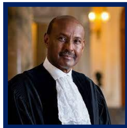
Abdulqawi Yusuf Judge, International Court of Justice