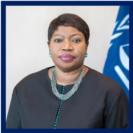
Fatou Bensouda Gambia High Commissioner to The United Kingdom & the Commonwealth