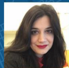
Isavella Vasilogiorgi United Nations