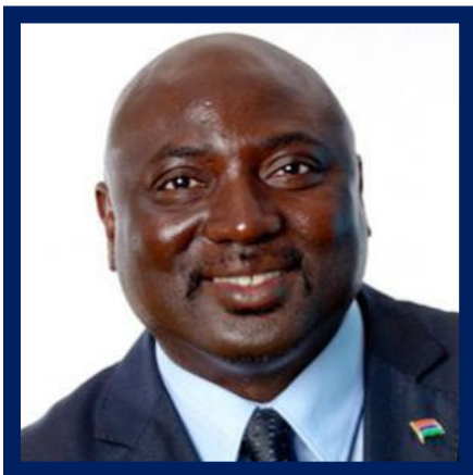
Mamadou Tangara Minister of Foreign Affairs The Republic of The Gambia